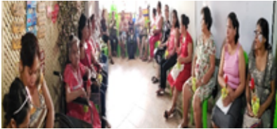
Mother's Day 2019 Full House