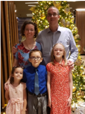
December 2019 Family Pic

"Home is where God puts you and with whom he puts you."